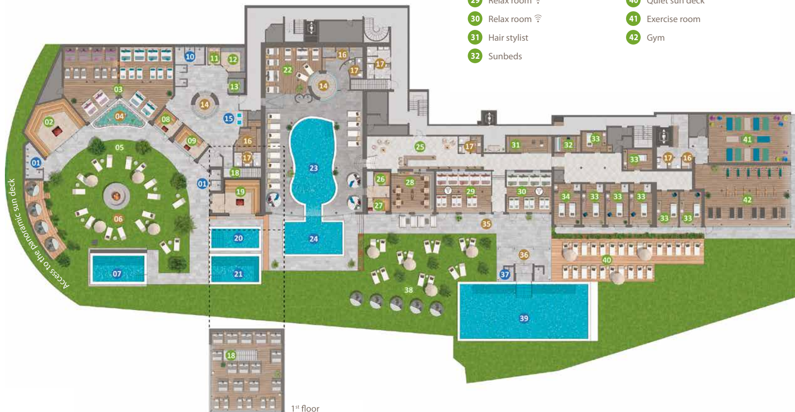
1 st floor